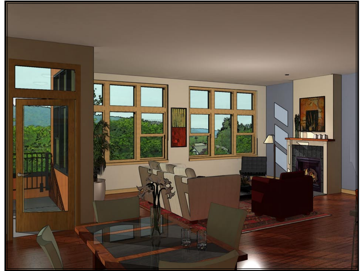
EXPANSIVE WINDOWS OPEN ONTO NEIGHBORHOOD VIEWS