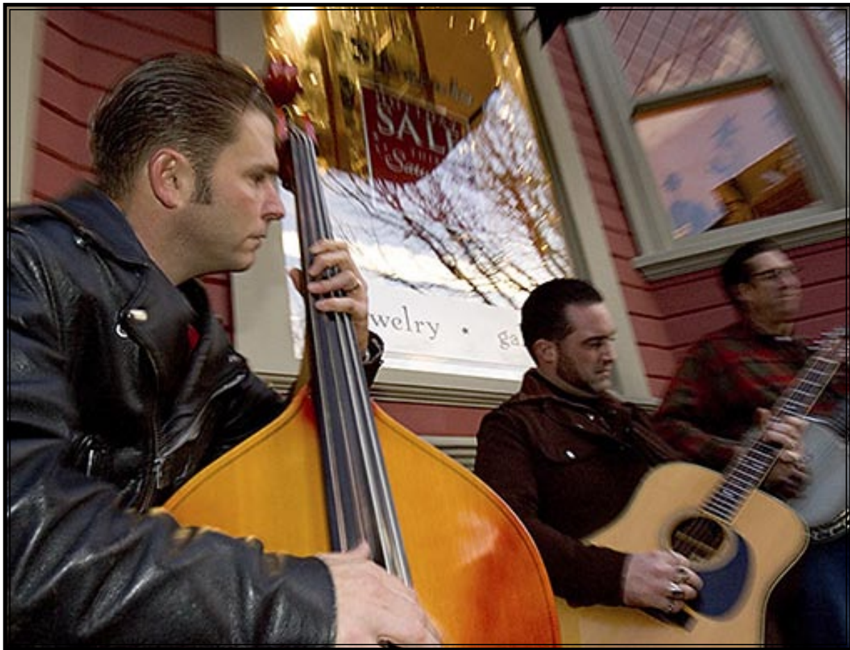
IMPROMPTU ENTERTAINMENT JUST DOWN THE AVENUE